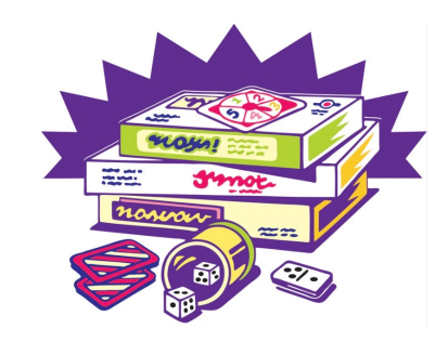
Game Night Saturday, October 28, 6:00 pm

The movie will be "The Goonies" and we will provide a build your own sandwich/ salad fixings along with drinks and dessert. A sign-up sheet will be in the back of the church starting September 3, the first Sunday in September.